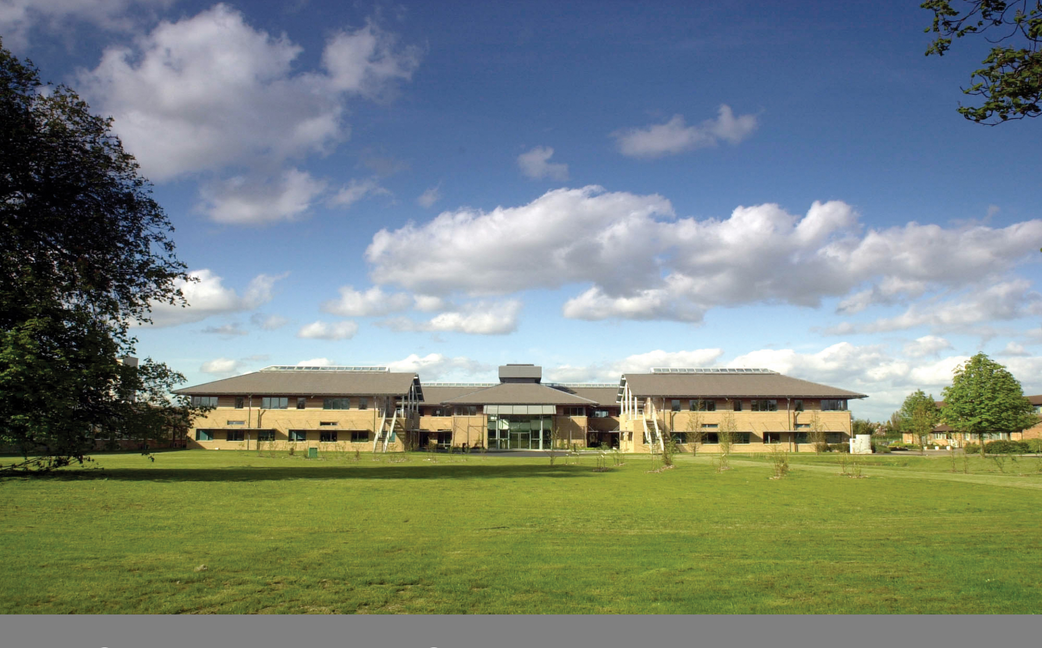
The Carbon Trust Low Carbon Incubator Program